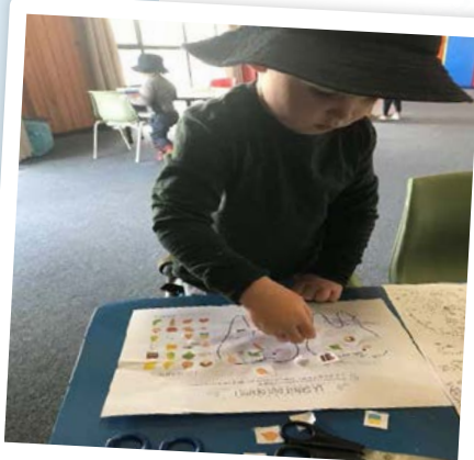
Tamariki undertook various art and collage activities and matching healthy foods and sugary foods to 'sad' and 'happy' teeth - Home Grown Kids Playgroup