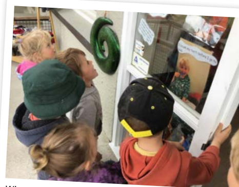
Whānau sent in photos of their tamariki brushing their teeth at home - Geraldine Kindergarten