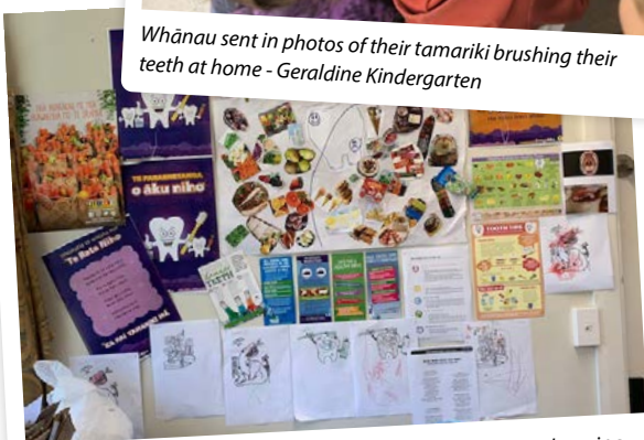
Tamariki have been little scientists engaged in experiments, learning about the effects of sugar on teeth, healthy food choices and the importance of brushing their niho - He Manu Hou