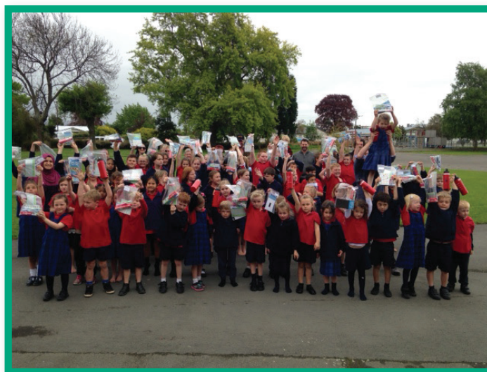
Waimate Main School children with oral health family packs and drink bottles.