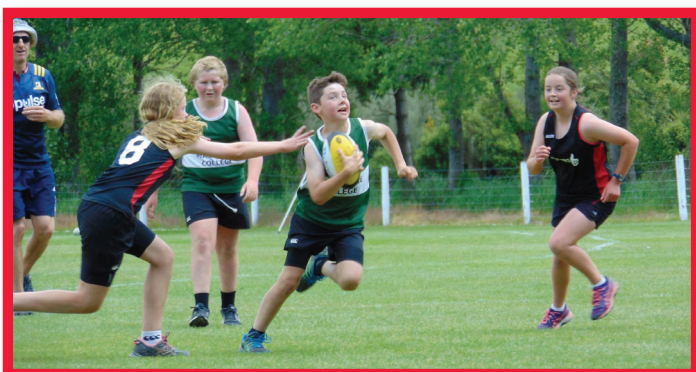
Mackenzie College in Touch Rugby final