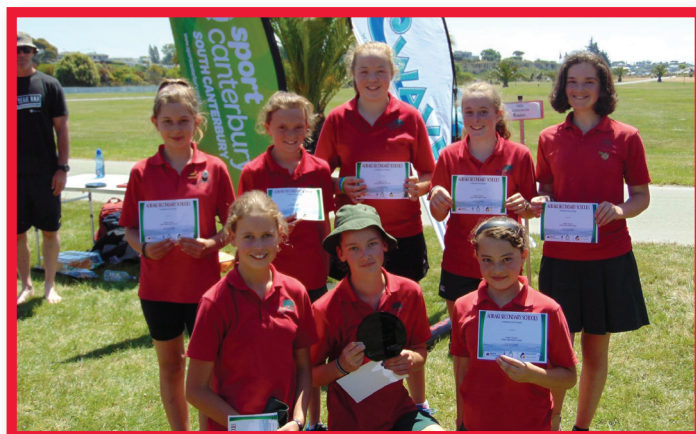
Barton Rural School's Girls Ki-O-Rahi team

Finally, two new initiatives were held in November – a Year 7 and 8 touch rugby tournament and a Primary School Ki-O-Rahi Festival. We were pleased to see a range of schools attend these events including some involved in inter-school sport for the very first time.