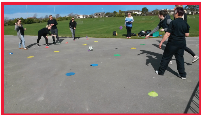
Teachers in action at the Sport Start Workshop

A Sport Start workshop had many teachers learning about physical literacy and the importance of developing the whole person through sport and PE sessions. The attendees left inspired with several new games added to their repertoire. These can now be shared at school with their classes and fellow staff.