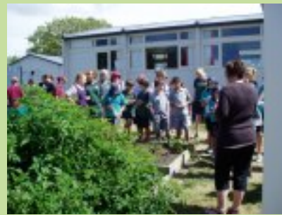
Students are "wowed" by the growth of Beaconsfield's edible gardens