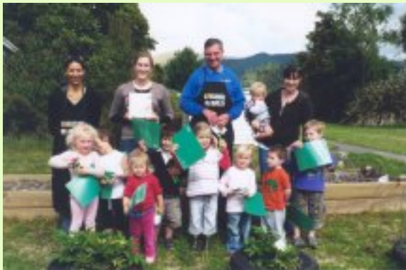
Winners: Peel Forest Montessori Preschool

We think every child who entered this competition is a winner – after all if you can bake a potato you can make a meal!