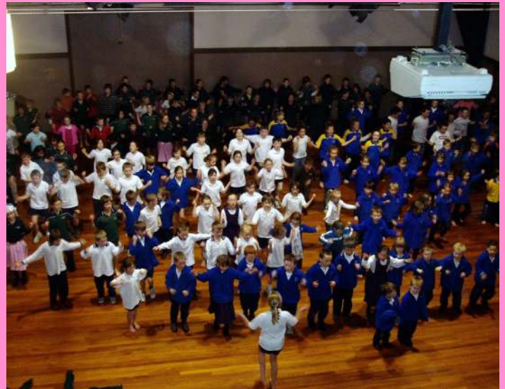
Whole group warm up including students from Fairlie Primary, St Josephs Fairlie, Albury & Tekapo Schools

Mackenzie's Jump Jam Experience was a whole school event for some of the smaller schools in the region with over 140 students taking part. Student leaders had helped to coach the younger children in preparation for their performance.