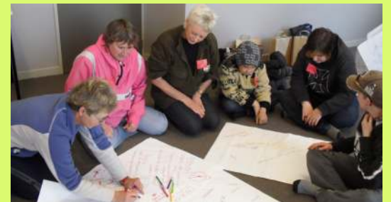
Brainstorming challenges around sustainable gardening