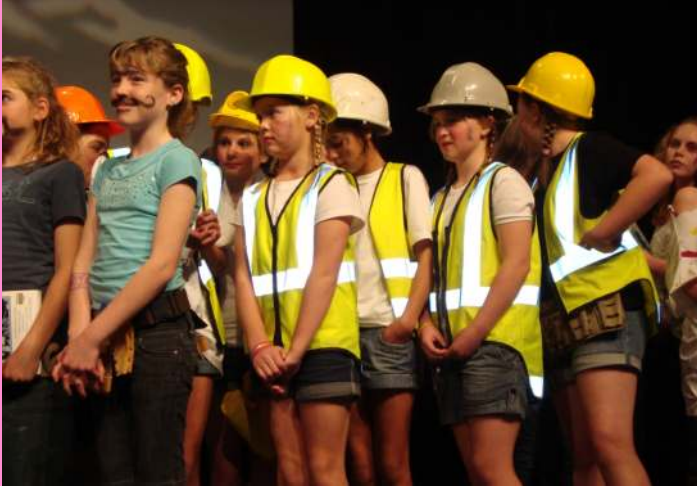
The 'Fix It Chicks' from Bluestone School

The Extravaganza saw 12 teams compete for trophies in age group categories. Well over 500 parents, teachers and supporters went through the Mountainview Auditorium during the evening to enjoy the spectacle and support their teams.