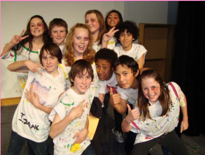
Dance Mafia Grantlea Downs