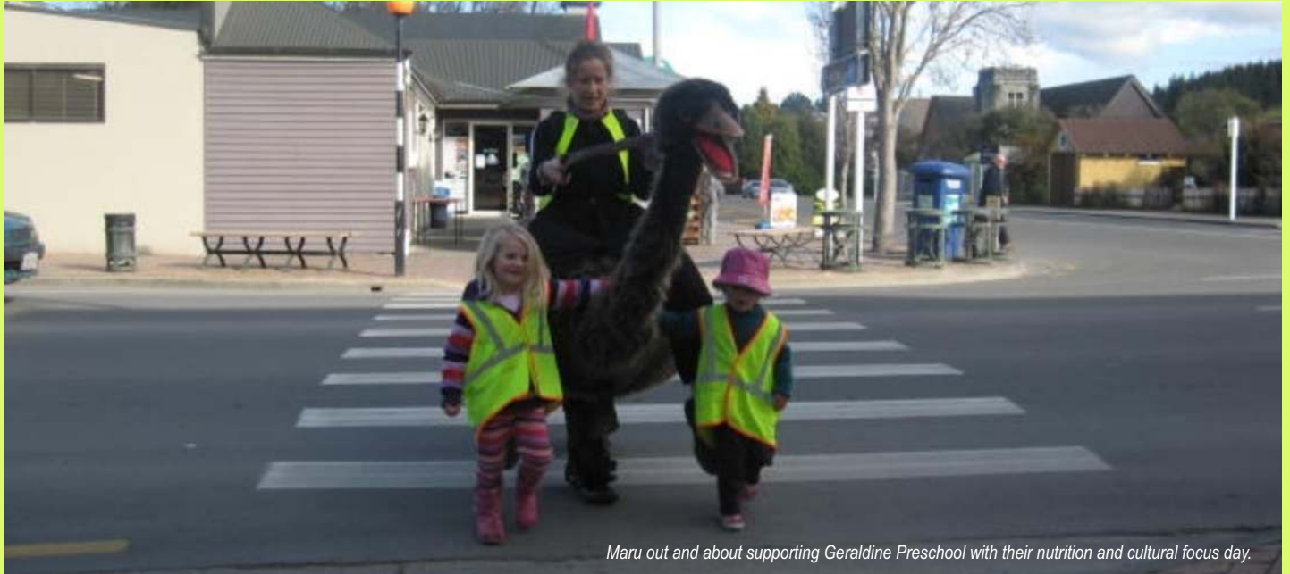
Maru out and about supporting Geraldine Preschool with their nutrition and cultural focus day.