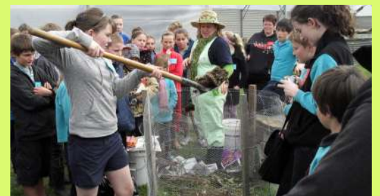
Layering up the compost - it's as easy as making a cake