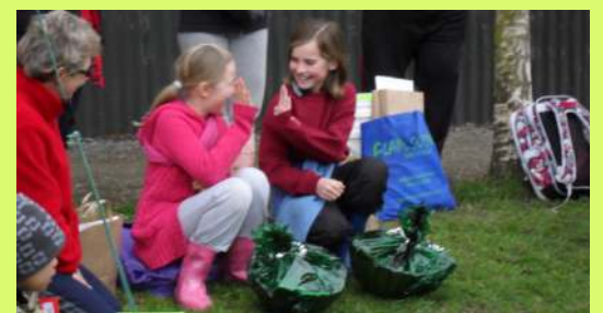
High 5 for the most creative gumboot and hat competition