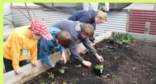
Students giving it a go themselves