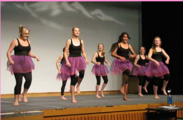
Timaru South pupils enjoying their routine

Mackenzie's Jump Jam Experience was a whole school event for some of the smaller schools in the region with over 140 students taking part. Student leaders had helped to coach the younger children in preparation for their performance.