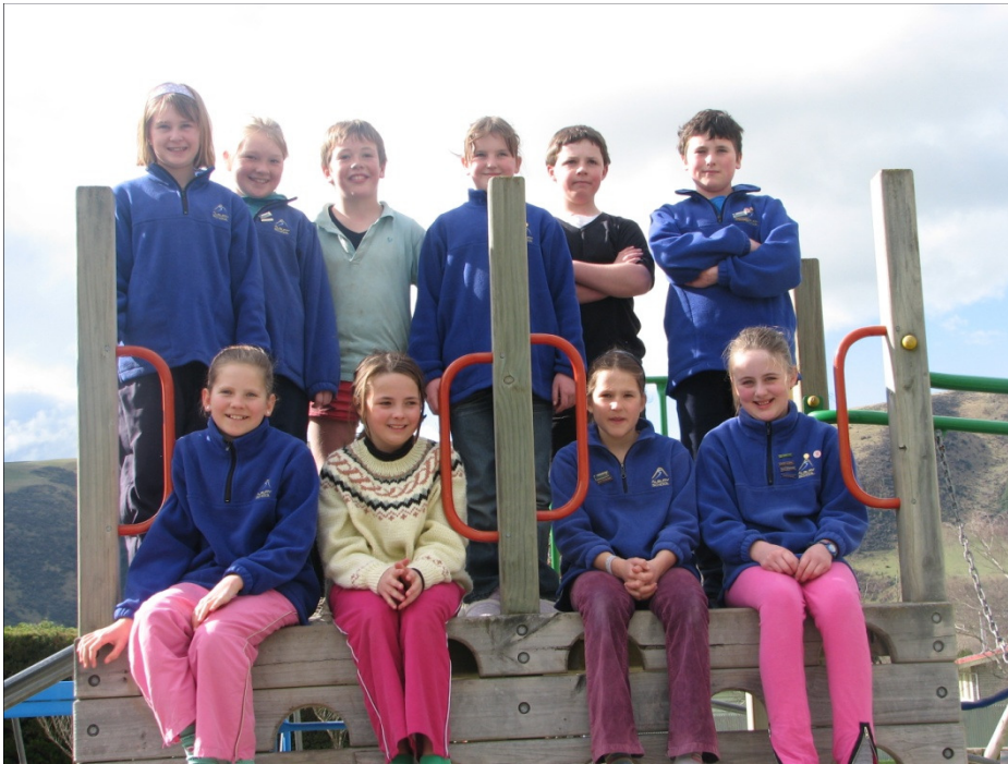
The Albury School WAVE Health Team